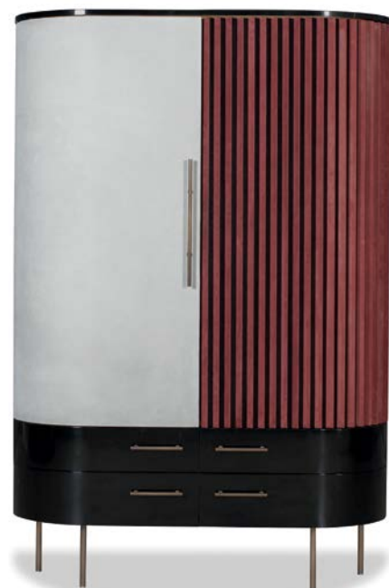
Kashmir Nuage | Kashmir Bordeaux

Struttura portante a scomparsa in tubolare di acciaio verniciato nero opaco. Struttura esterna in parte rivestita in pelle e in parte con motivo plissé triangolare, da un lato in legno rovere tinto nero opaco da un lato rivestito in pelle. Finitura frontali cassette e coperchio mobile laccato nero lucido. Interno in acero naturale con ripiani in vetro. Maniglie e piedini in metallo brunito spazzolato a mano con vernice opaca.