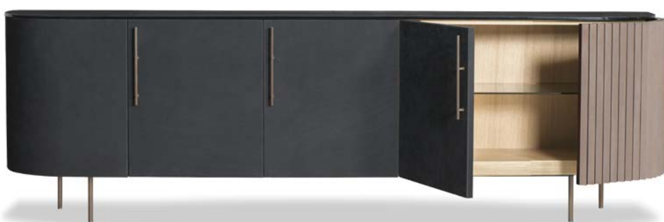
Nabuck Charcoal | Cloister Sand